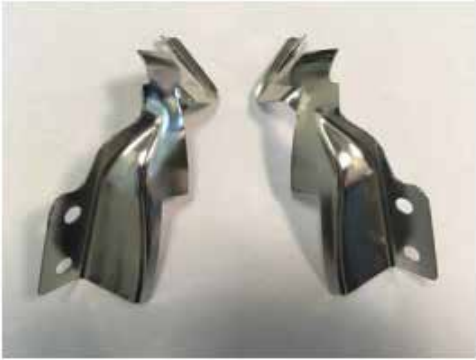
1955~1957 Chevrolet Upper Windlace Retainers 2-Door Hardtop & Convertibles

Replace your rusty or missing windlace guides with this brand new item